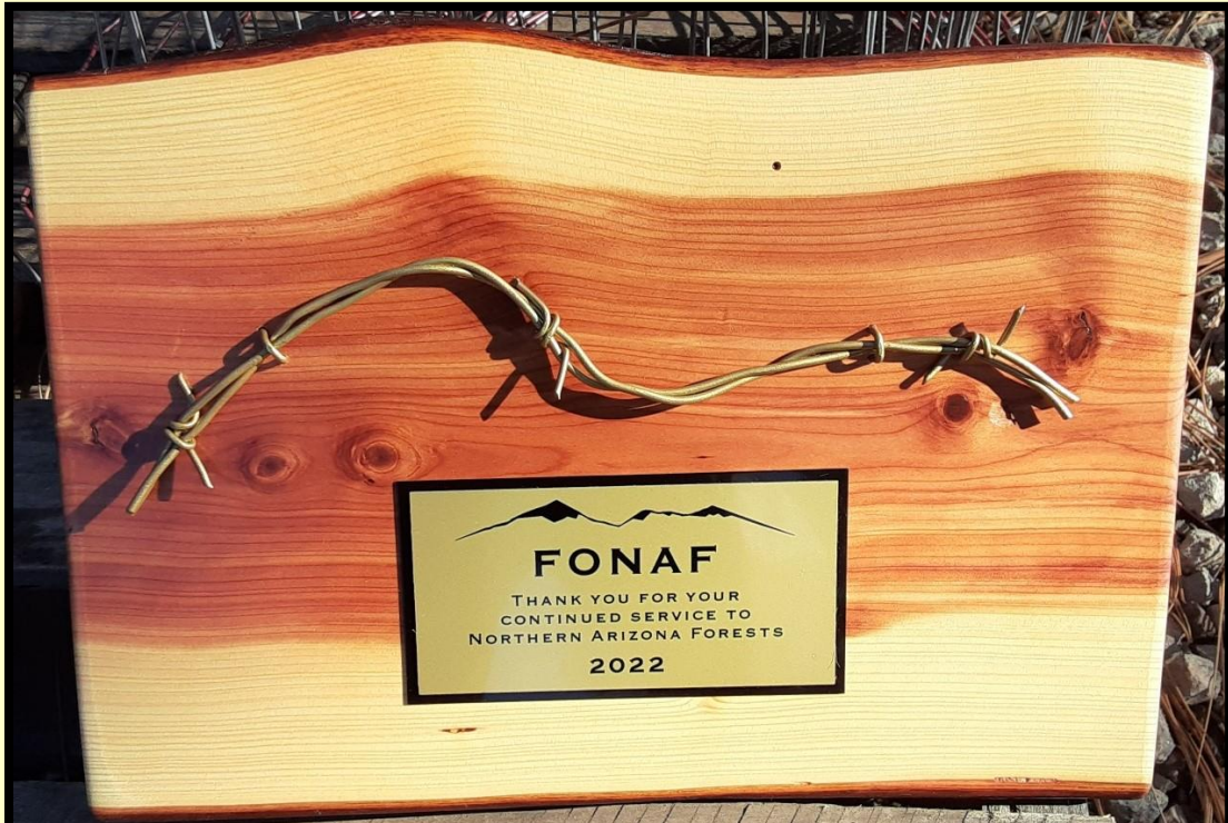
Gold Barbed Wire Award

The late afternoon event did not go without some drama. The original pizza party was scheduled for Monday October 3 rd at one of the camp sites in Camp Elden at