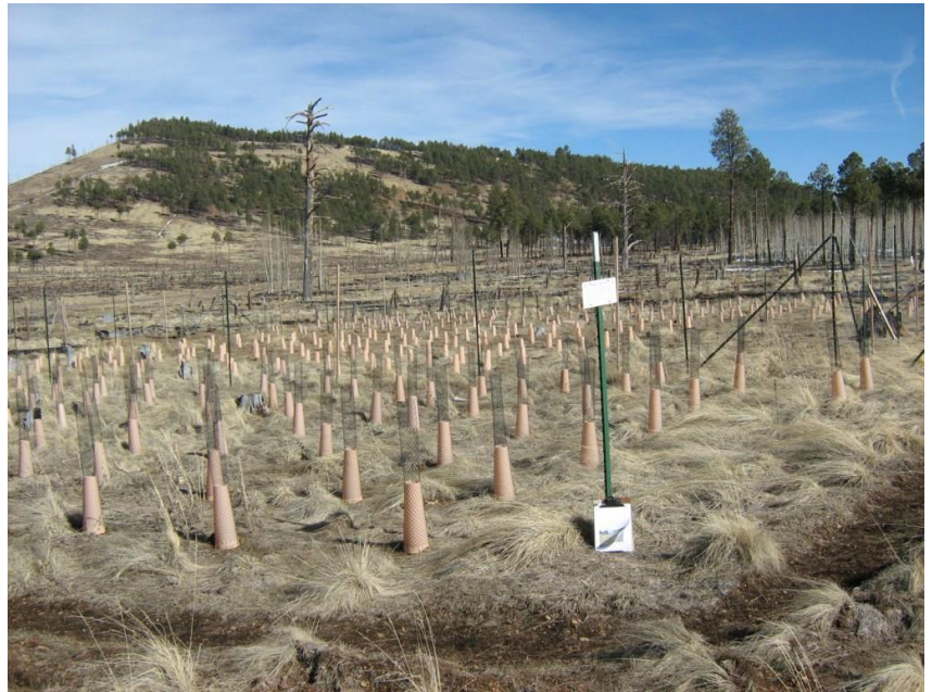
Here's a photo of the site as of February 17, 2014.