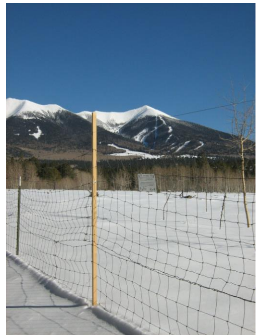
Fence keeps elk out in mild winter.